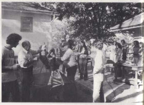
AEPi, 1976: Pig roast started appearing in the Modulus as one of AEPi's main activities, helping make the event synonymous with the chapter.

Located at one block south of the school on College Street, AEPi has two houses and a special "party house." Perhaps their major social project consisted of the semi-annual pig roasts. Throughout the year, the AEPi's made several trips to chapters at Bowling Green and Indiana Tech for further socializing.